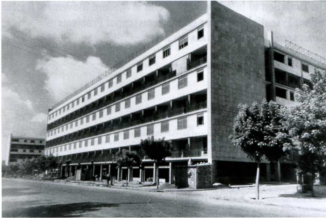
Figure 1. Casa Bloc (1934-38), Barcelona. Sert, Torres Clavé and Subirana. In the 1930's.

In February 1937, with the Civil War raging but with hopes of suppressing General Franco's military insurrection still alive, the government of the Republic decided to participate in the Paris World Fair. A pavilion, whose main objective was to exhibit the values and aspirations of the Second Republic, was erected to showcase a country in full process of modernization and innovation, despite the difficulties imposed by the circumstances of war. This was fully expressed in the contrast between the austerity of the materials used for its construction, such as the Uralita fibro-cement panels and the quality and abundance of the artwork exhibited inside. Once the event had finished, the building was demolished and forgotten while the artworks it housed were dispersed, due to the war. Pablo Picasso's 'Guernica' would not return to Spain until 1981.