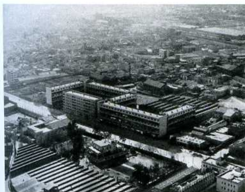
Figure 2. Casa Bloc with the sixth block added.

This period coincided with a growing number of intervention projects to recover and conserve Modern architecture in various other countries. Specific problems common to the restoration of this type of architecture started to become evident during this period. So, despite having overcome the problems related to the political and social value of the GATCPAC work, such intervention projects have to be understood within a context in which the discipline specific to Modern Movement architectural restoration was just beginning to be developed. This is why it is currently relevant to analyze the intervention criteria applied, and to distinguish between essential problems – those that are intrinsic to the conception and materialization of these works – and circumstantial problems – those that are characteristic of a historically and politically determined conjuncture, in order to understand the consequences they have on long-term preservation.